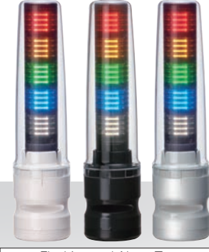
Flashing and Alarm Type

LS7-FBWH [Continuous on/flashing/2 alarms] (Lead wires)