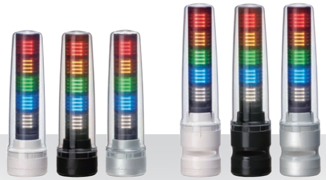
Continuous On Type LS7-WH (lead wires) LS7-WC (M12 connector)