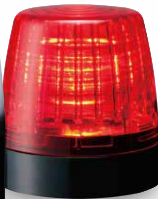
Mono-color Model (Red)